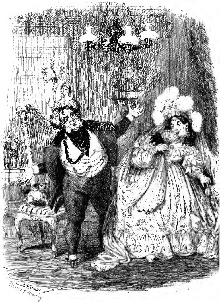
Interview between Lord Muchlebury and